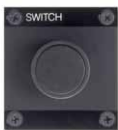
4PULN - 4PULR (60x65x50)